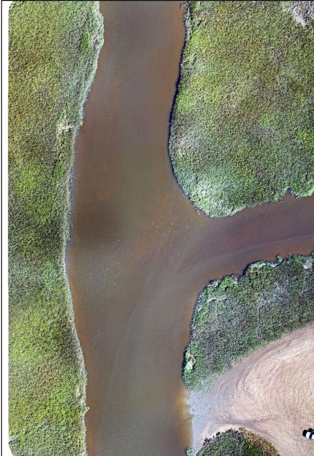
Mavic 2 Pro Drone Imagery - 0.43 In Resolution