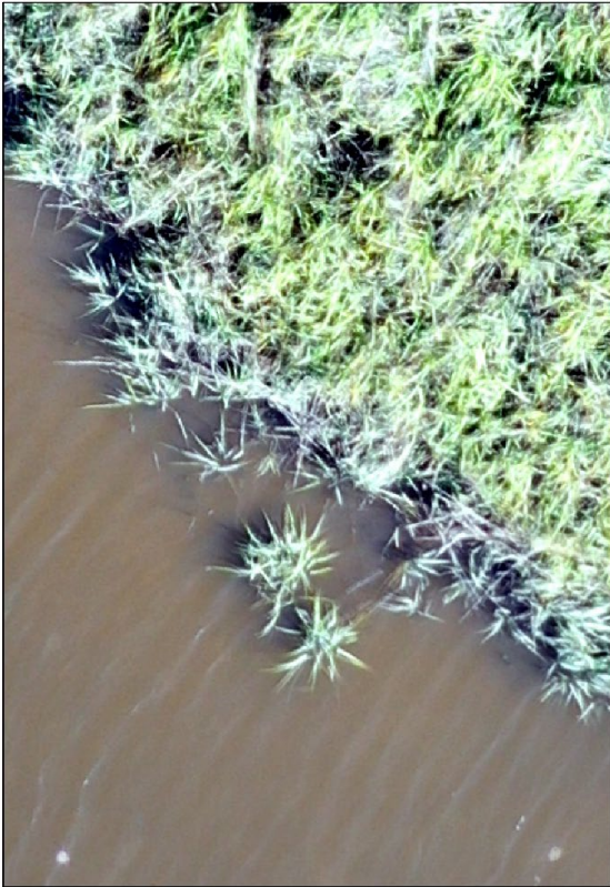
Mavic 2 Pro Drone Imagery - 0.43 In Resolution

Results from the UAS EBHM analysis provided 2.3-inch resolution, allowing users to zoom in tight on features without distortion. North Carolina has exceptional imagery services for the state; however, the resolution is limited to six inches. Further, the service is only flown every four years, and not typically at low tide. UAS solutions allow for more detailed analysis at varying times of day and tide conditions.