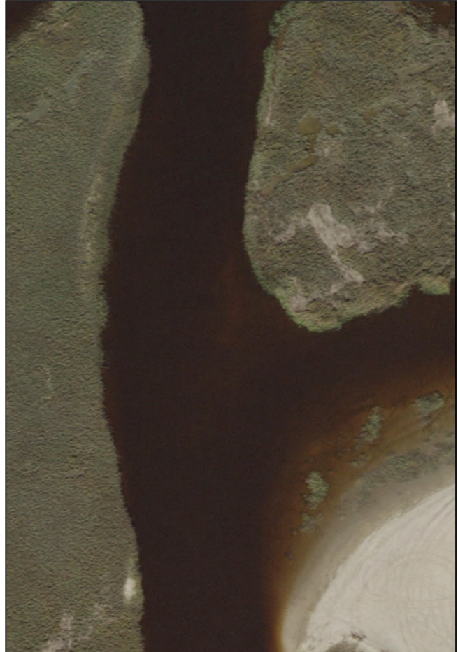
2016 NAIP Imagery - 6 In Resolution