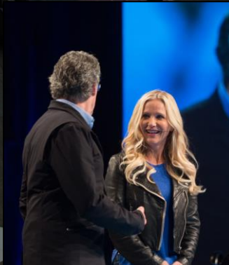
Behavioral Health & Addiction